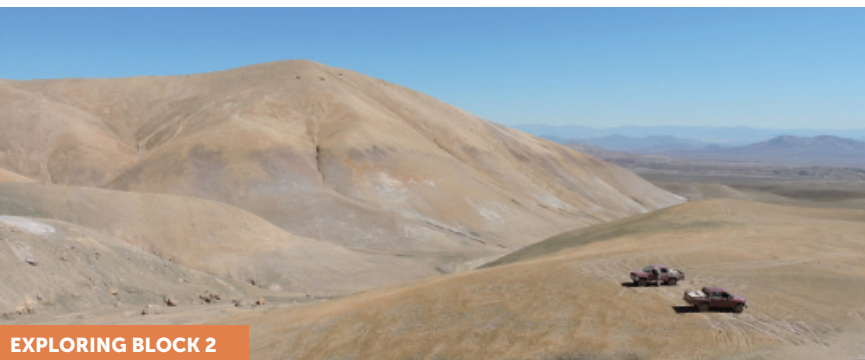
EXPLORING BLOCK 2

(1) NON PRODUCING ROYALTY (2) PROJECTS LOCATED TO THE SOUTH OF MAP